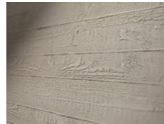
timber formwork 122