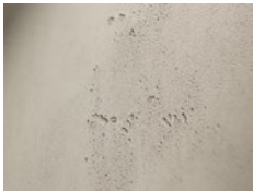
smooth formwork grey 120