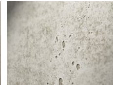
Vintage standard 224