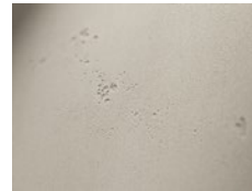
Vintage light 223