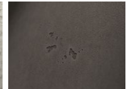
Vintage anthracite 226